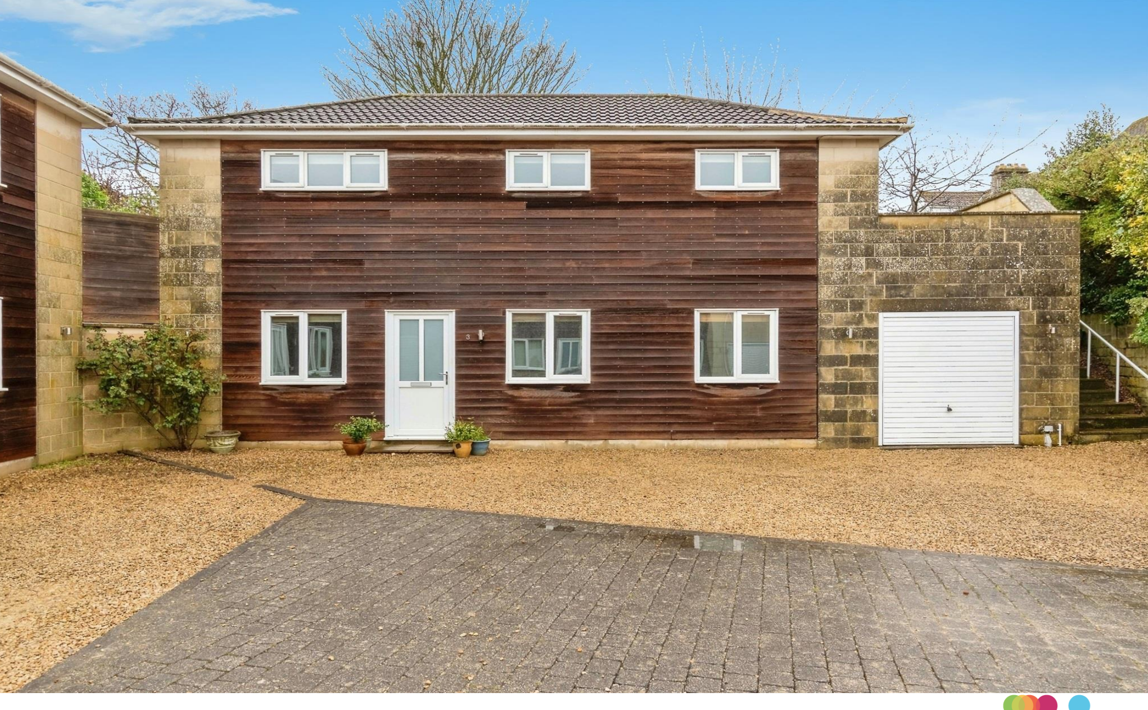
Crescent Place Mews, Bath, BA2 2PY