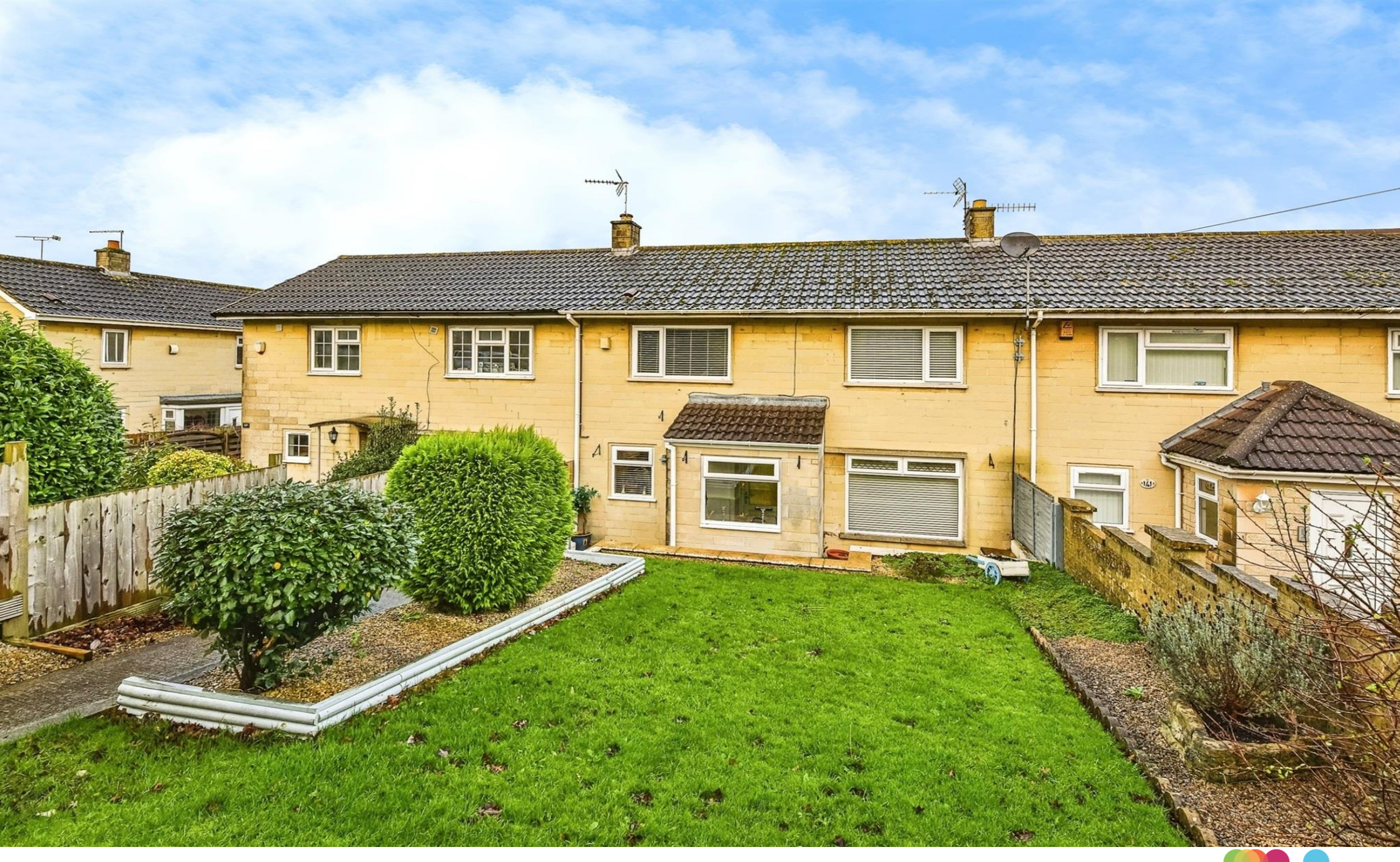
Sheridan Road ,Bath, BA2 1RA