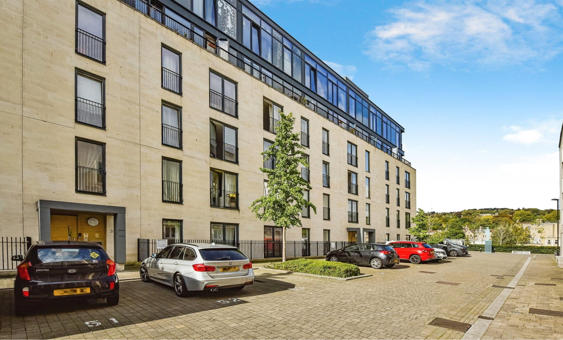
Leopold House, Percy Terrace, Bath BA2 3GE