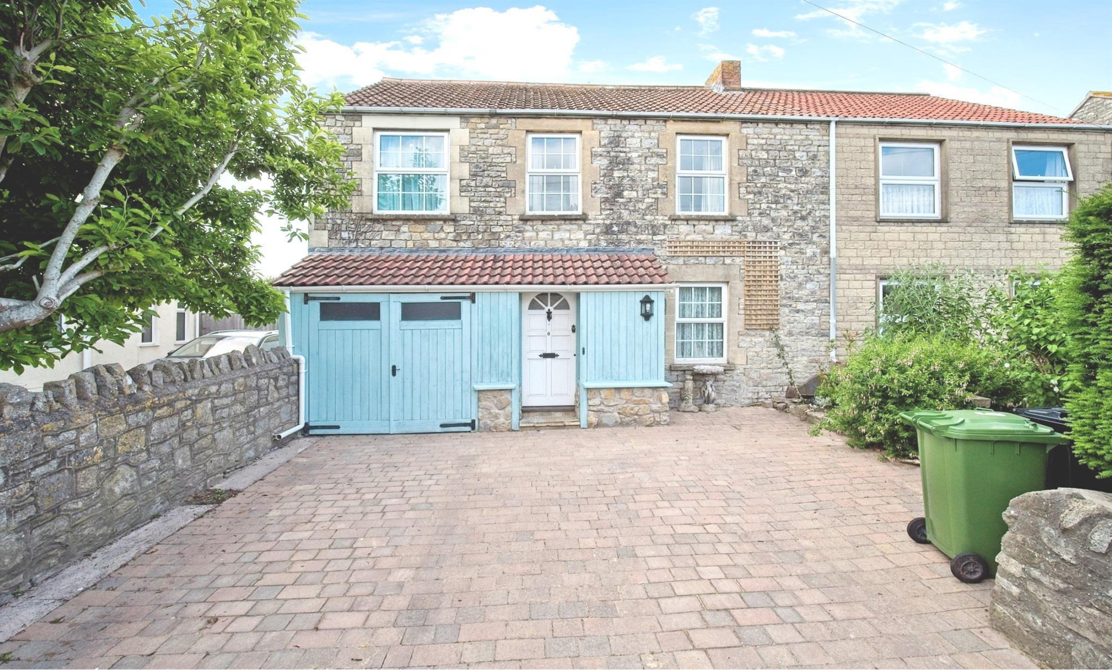
Albert Road, Keynsham Bristol BS31 1AA