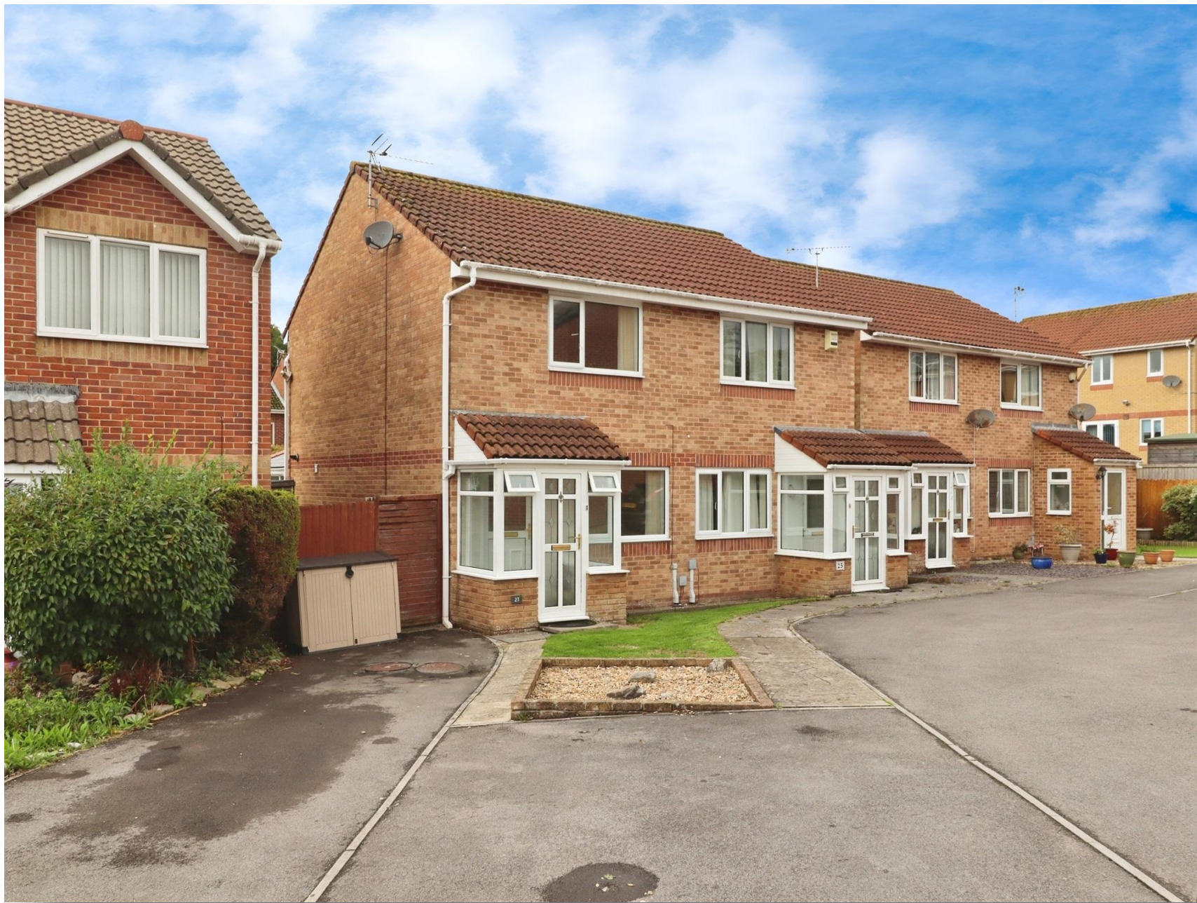
Bramble Avenue, Barry CF62 7JN