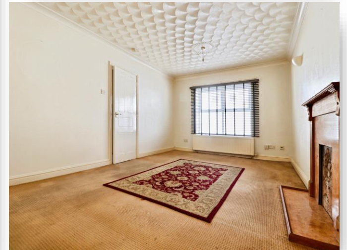
Crossways Street, Barry CF63 4PQ