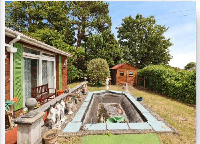
Pardoe Crescent, Barry CF62 8EQ