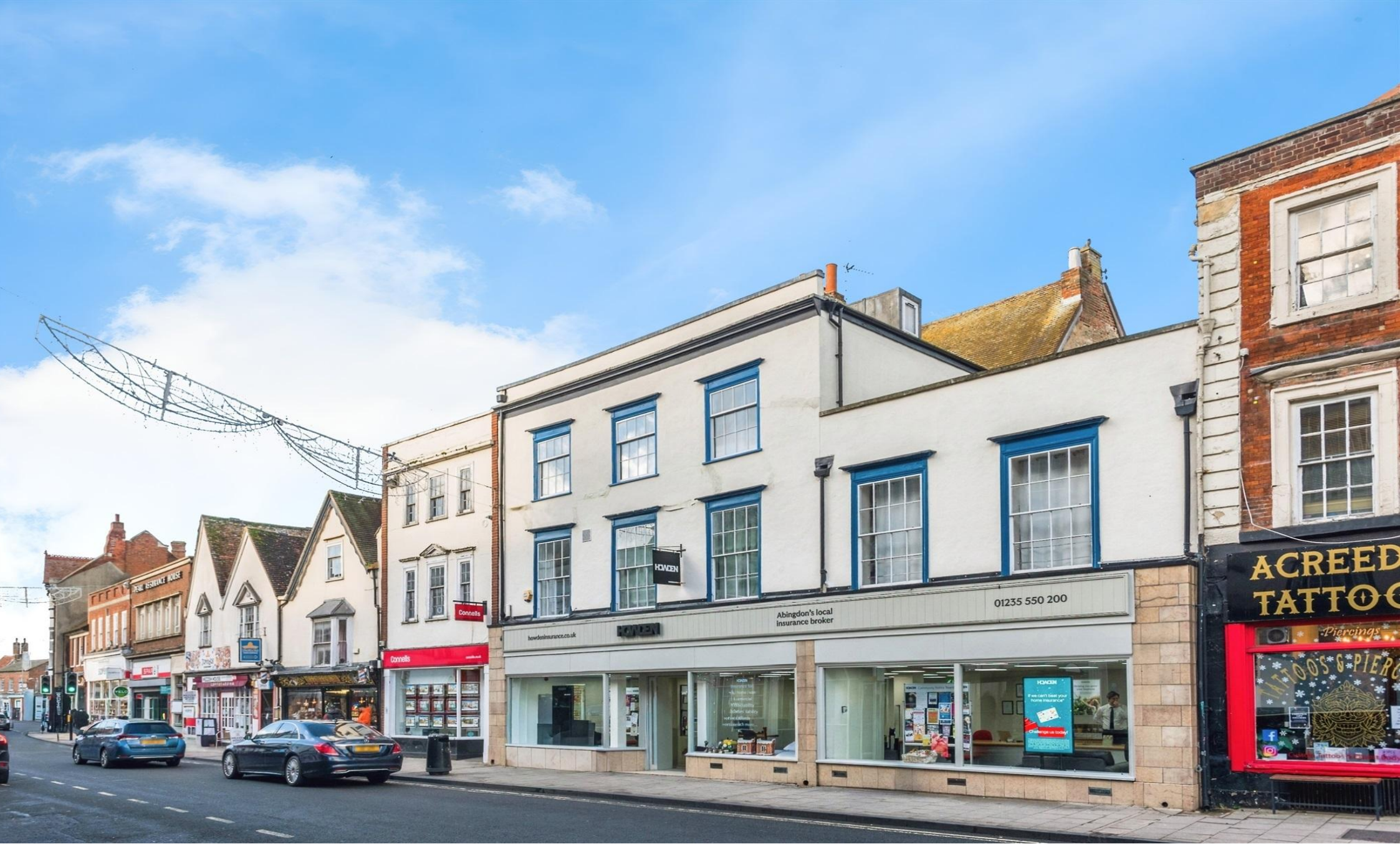
The Old Mayors House, Bury Street, Abingdon, OX14 3QY