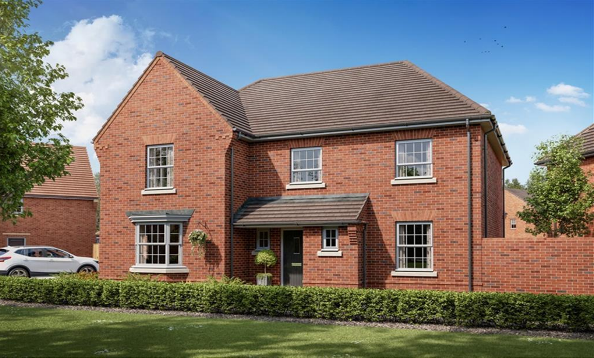
The Manning, Abbey Fields, Baileys Crescent, Abingdon, OX14 1TJ