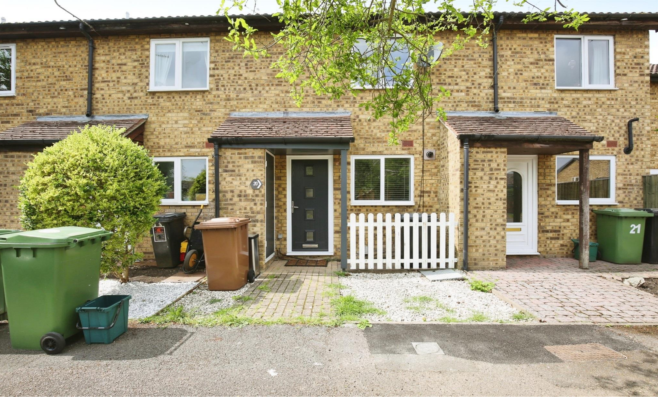
Riley Close, Abingdon, OX14 5RR