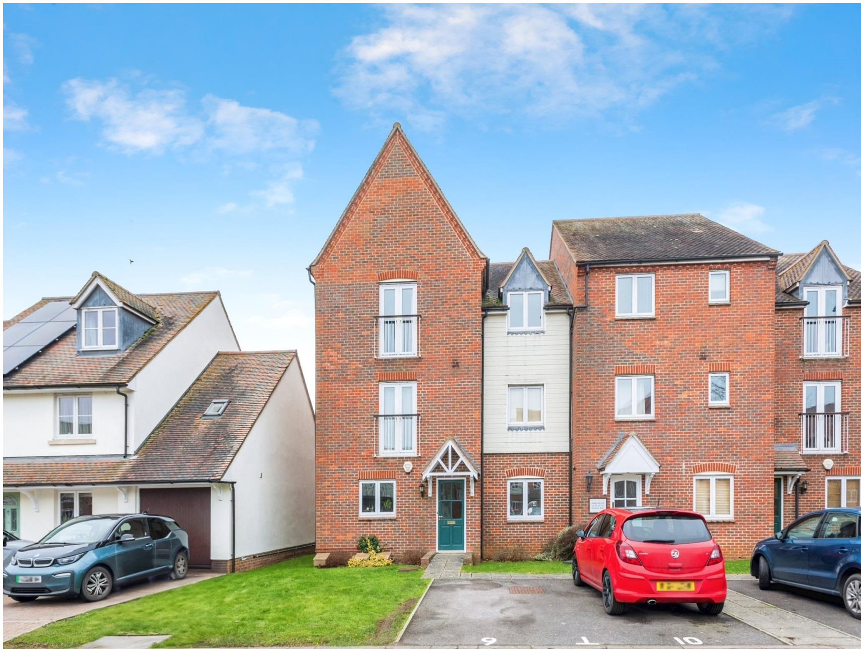
Marina Way, ABINGDON, OX14 5TN