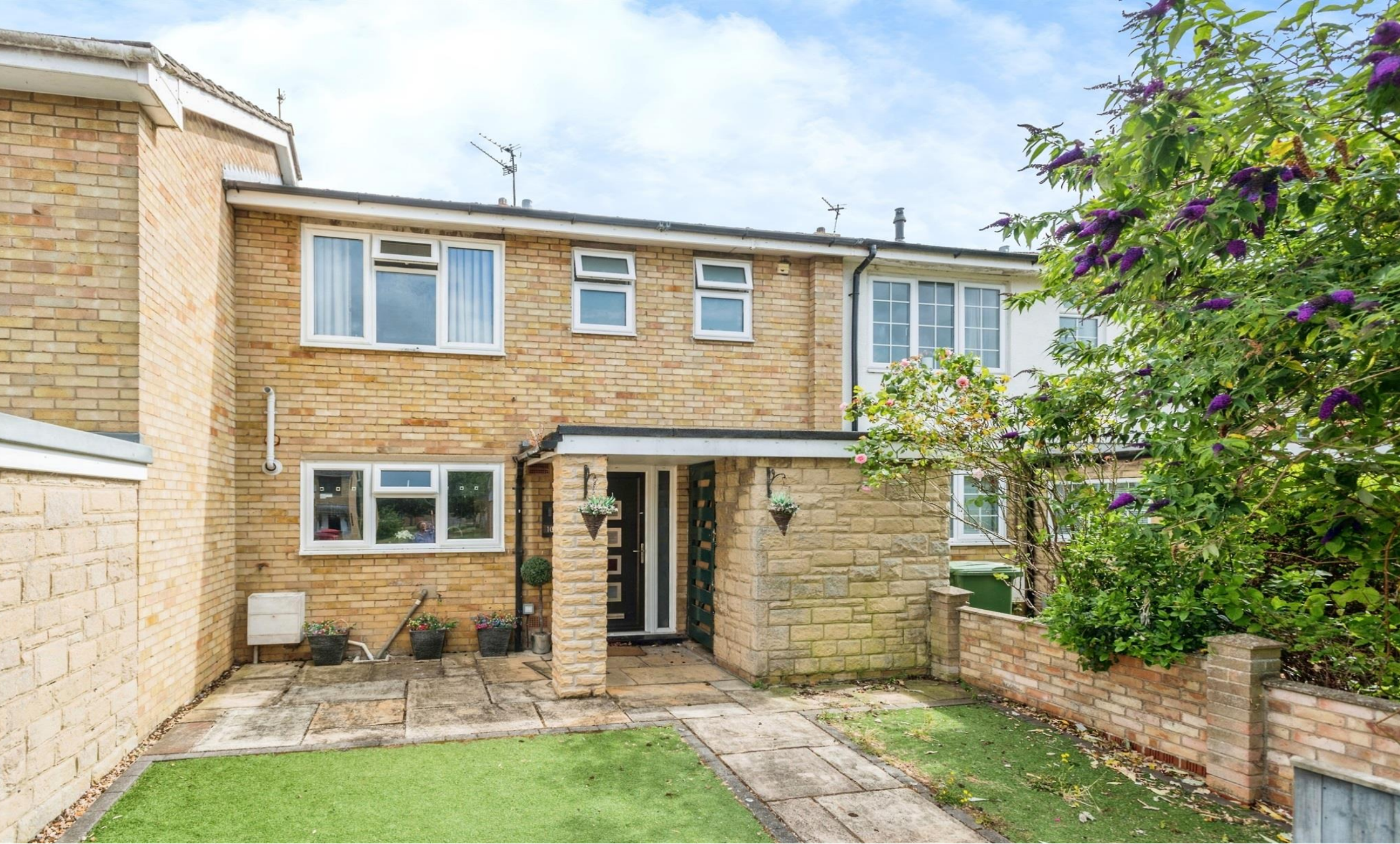
Haines Court, Marcham, Abingdon, OX13 6PN