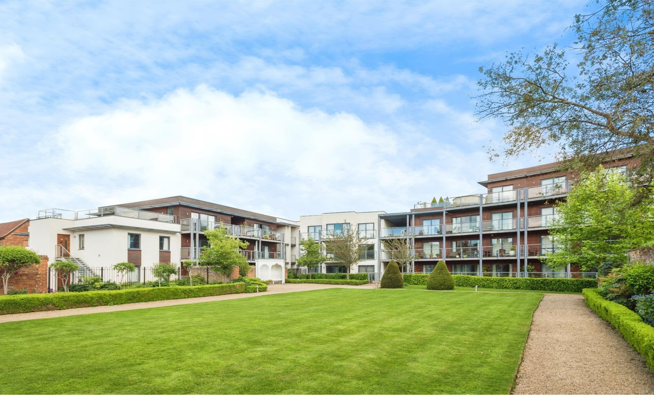
The Old Gaol, Abingdon OX14 3HE