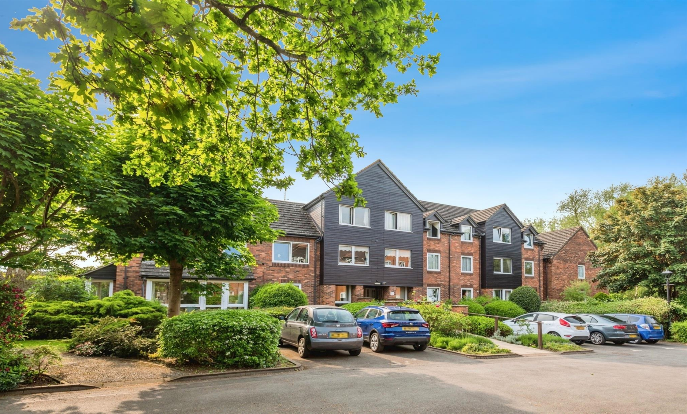
Cygnets Court, Caldecott Road, Abingdon, OX14 5ET