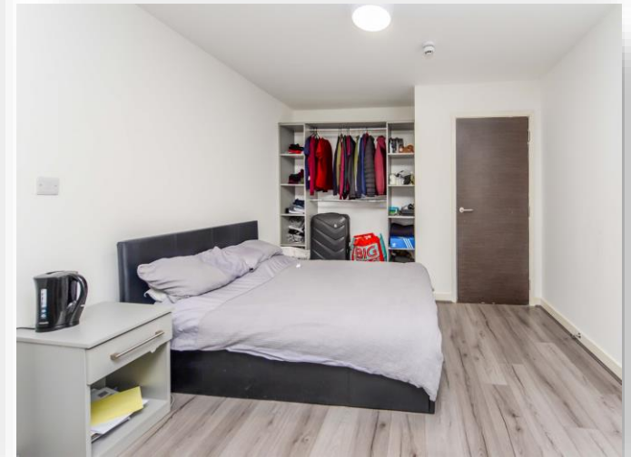
Baltic 56 Norfolk Street, Liverpool L1 0BE