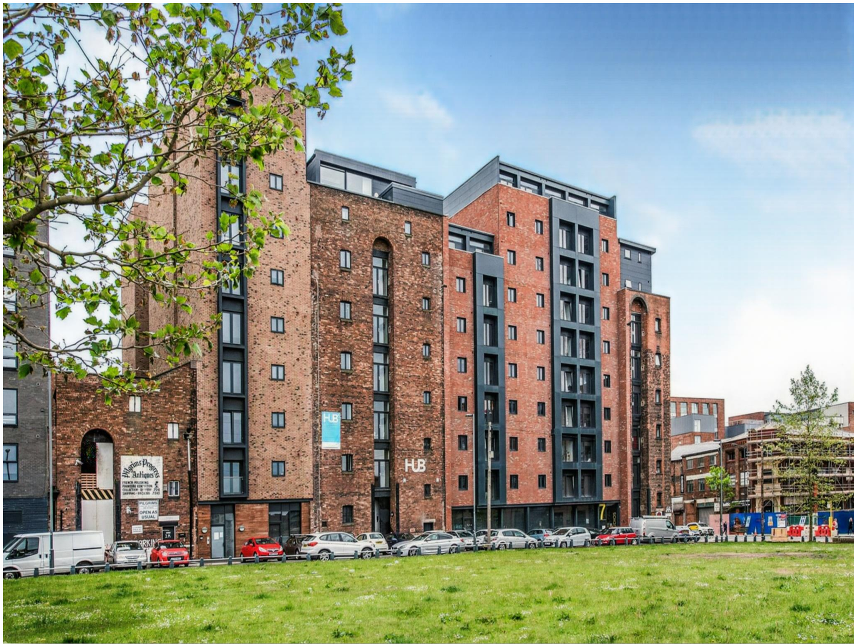
Flat 6 University House Bridgewater Street, LIVERPOOL L1 0AR