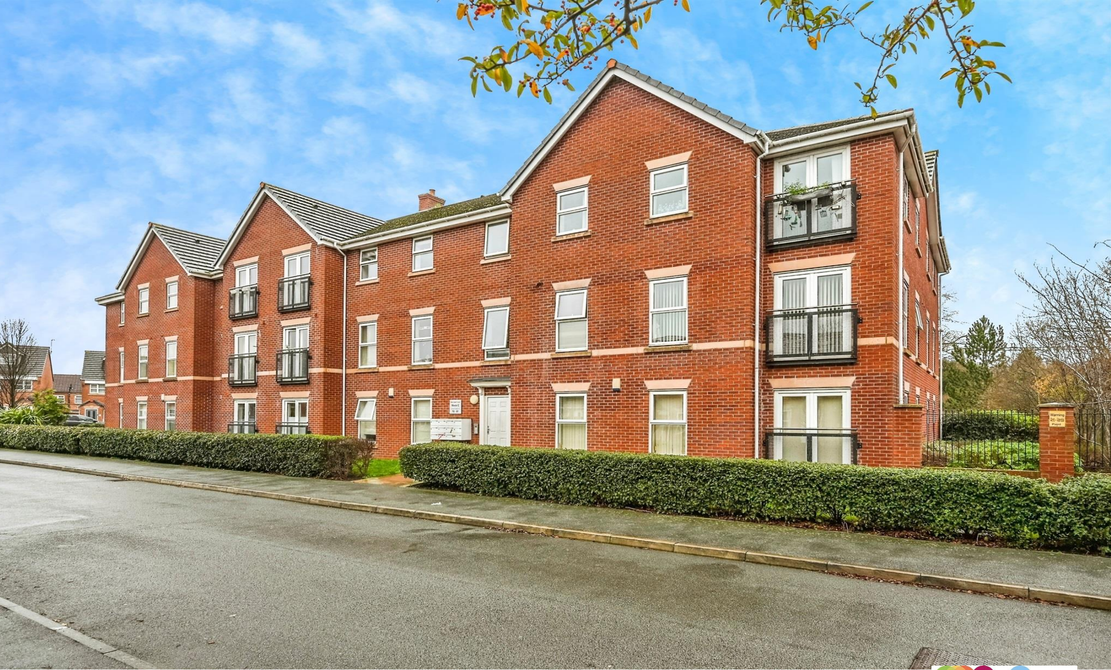
Mystery Close, Liverpool L15 0AB