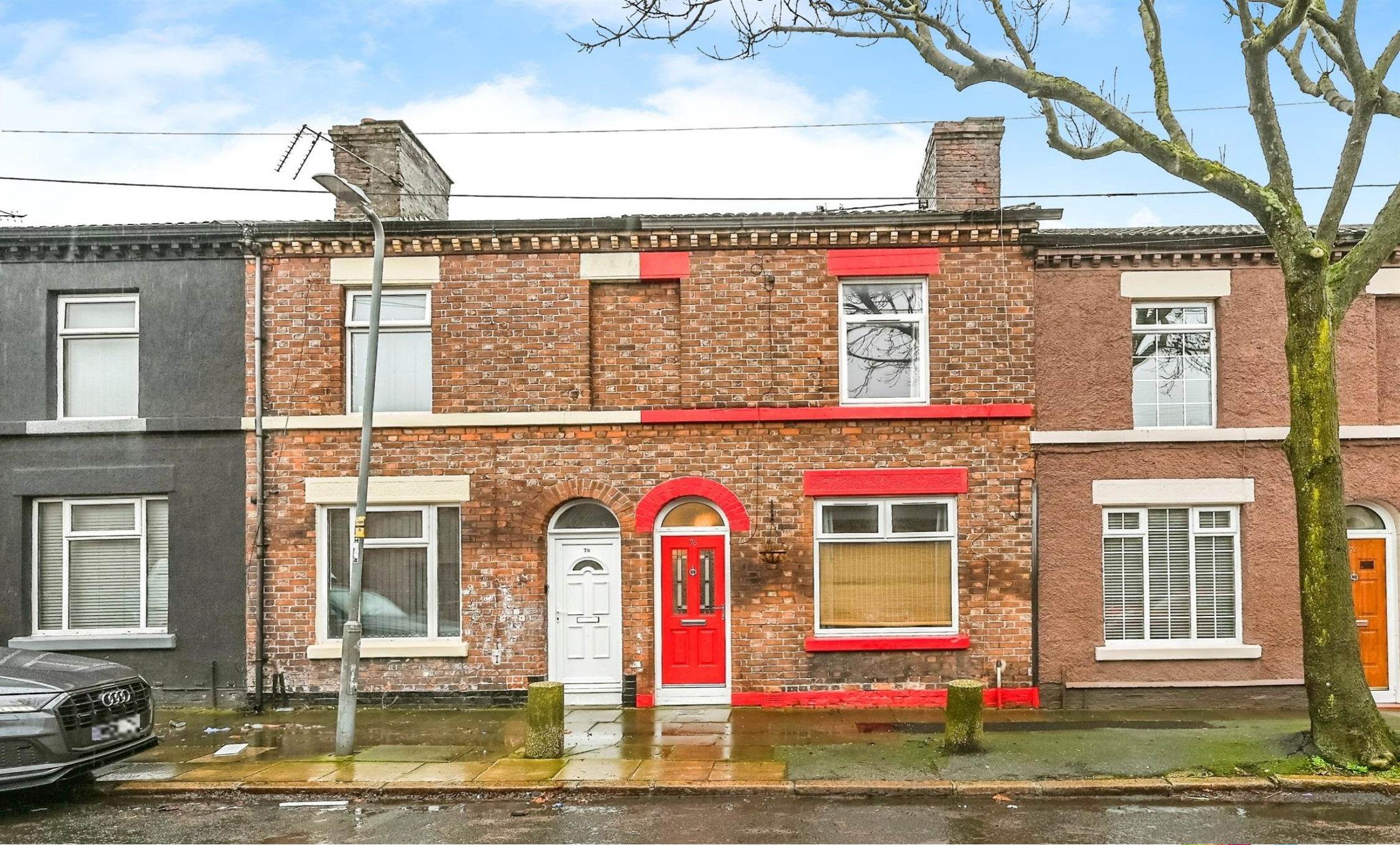
Pickwick Street, Liverpool L8 5TW