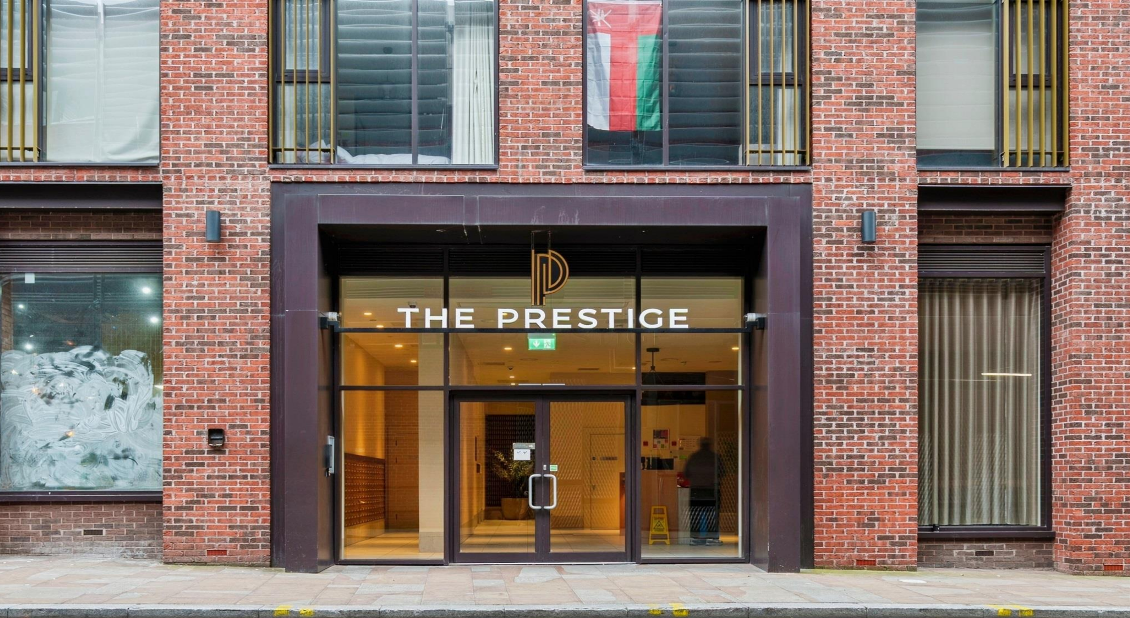
The Prestige David Lewis Street, Liverpool L1 4UF