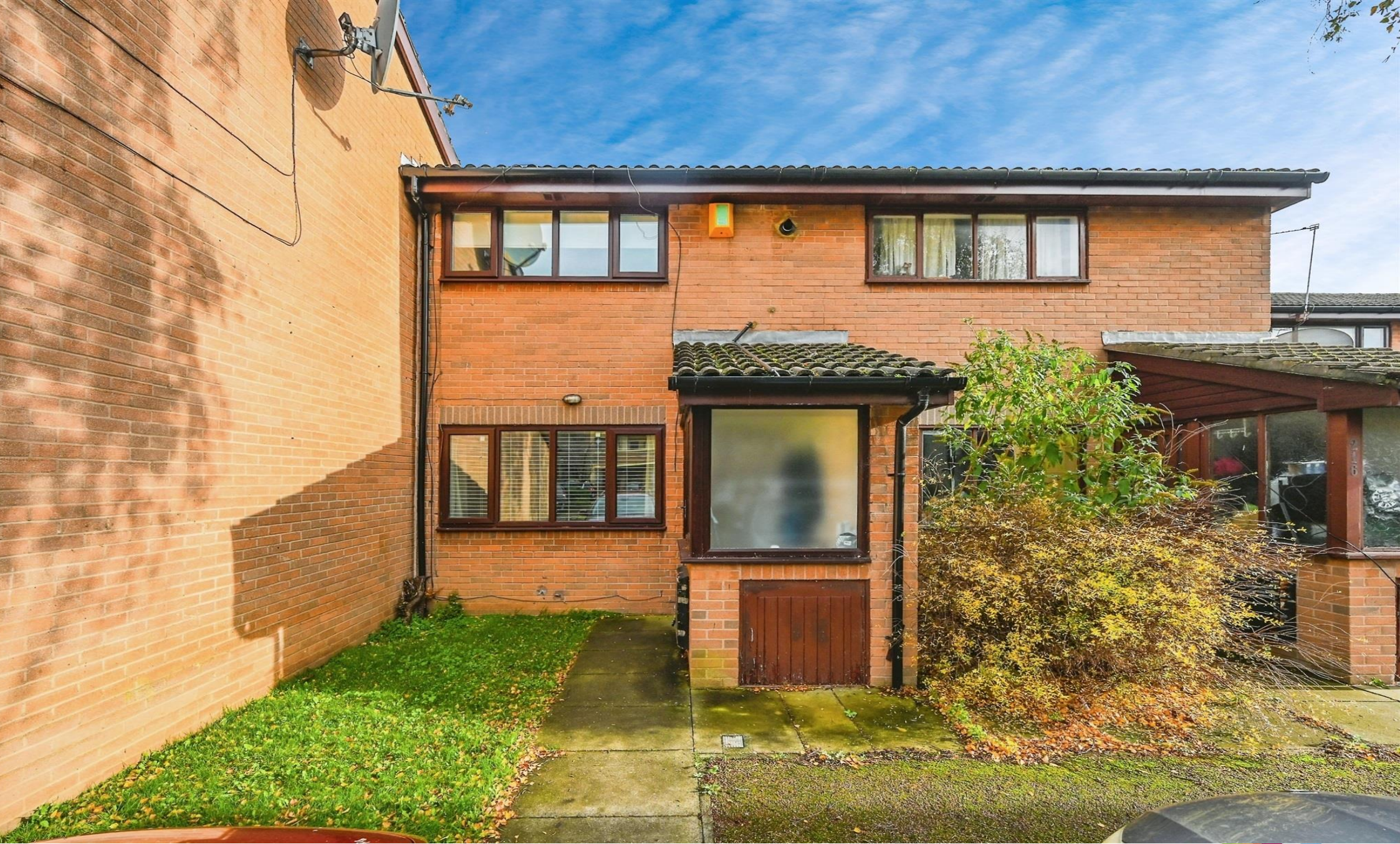
Minster Court, Liverpool L7 3QH