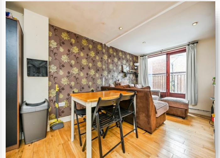
Upper Hampton Street, Liverpool L8 1TL