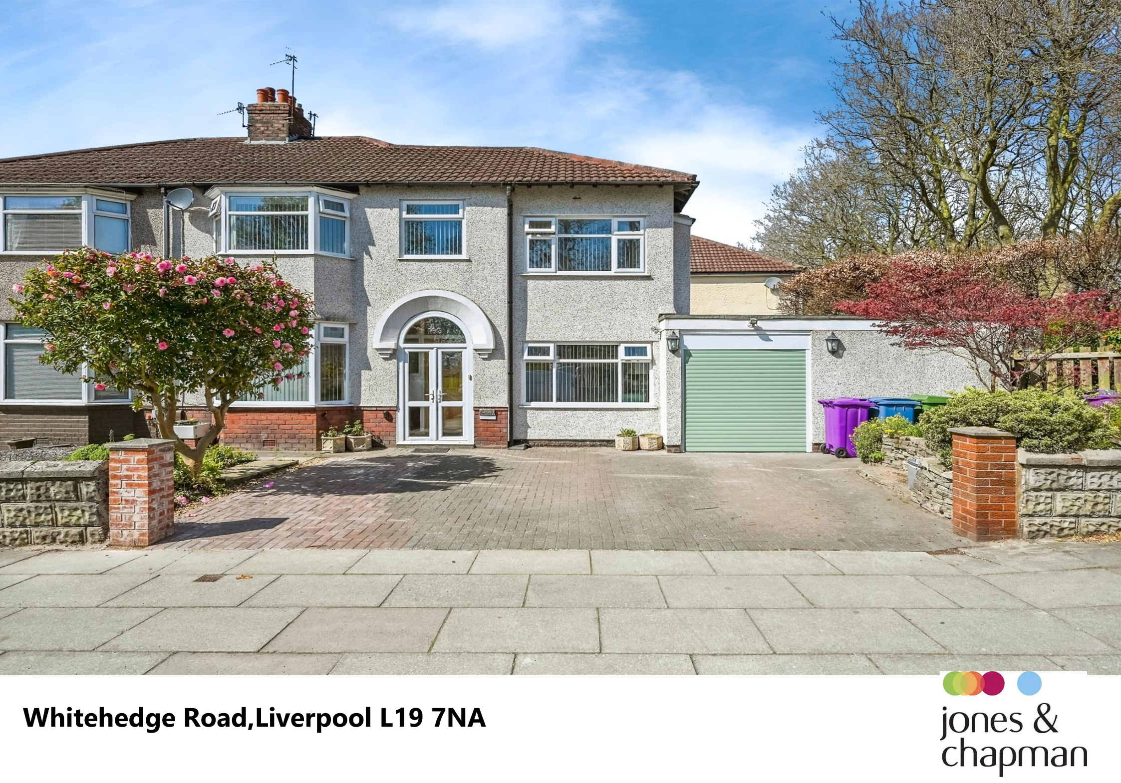
Whitehedge Road, Liverpool L19 7NA