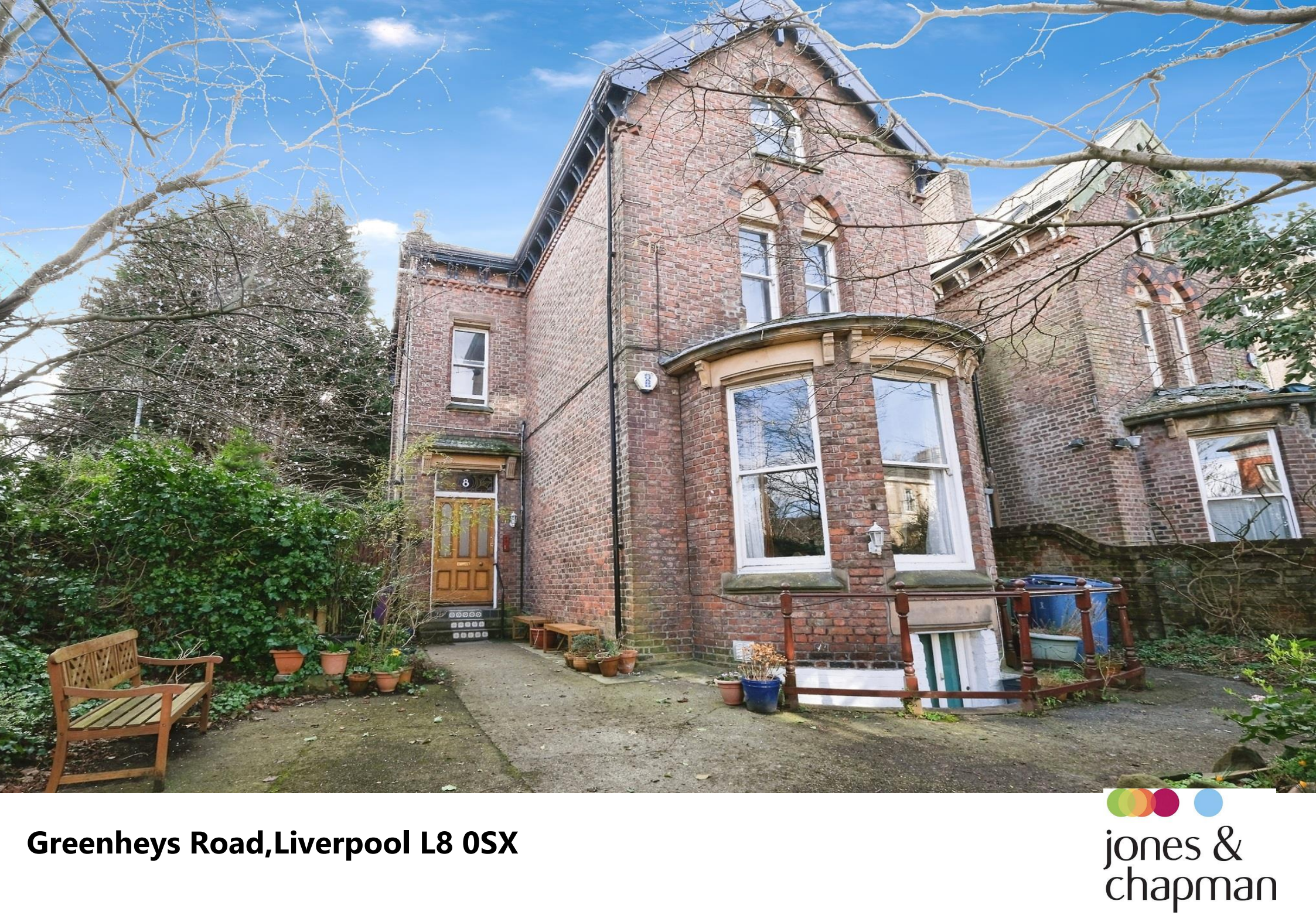
Greenheys Road, Liverpool L8 0SX