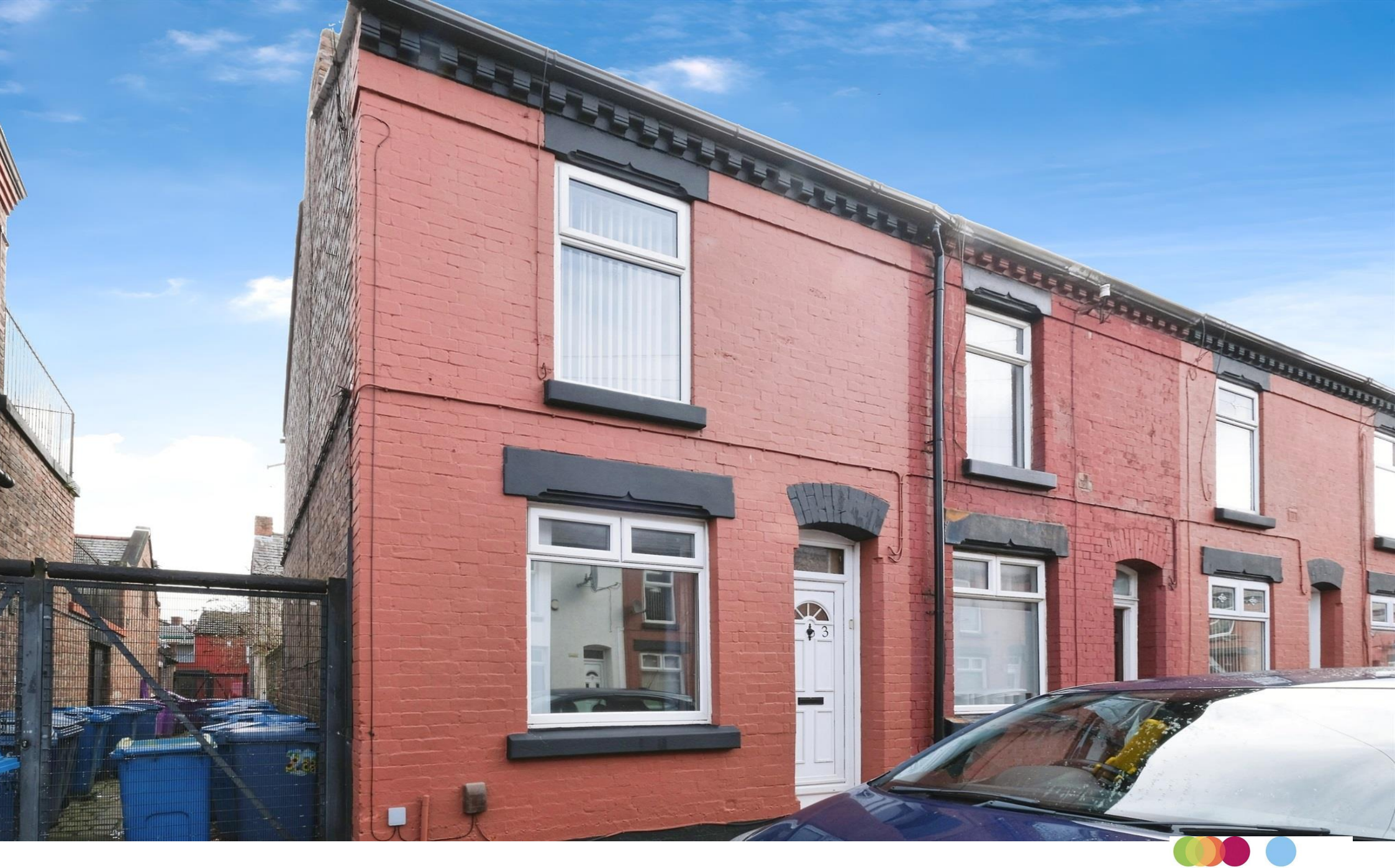
Gordon Street, Wavertree Liverpool L15 0ED