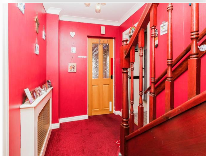
Canterbury Park, Liverpool L18 9XP