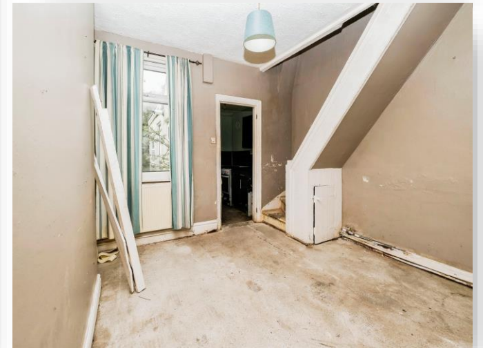
Macdonald Street, Liverpool L15 1EL