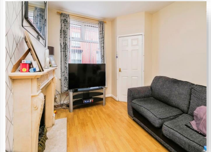
Winkle Street, LIVERPOOL L8 8DB