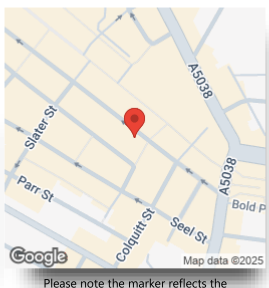
postcode not the actual property