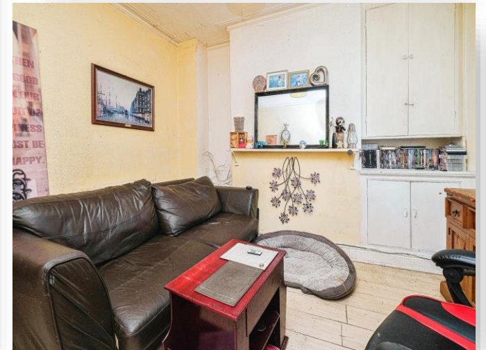
Sandbeck Street, Liverpool L8 4RU