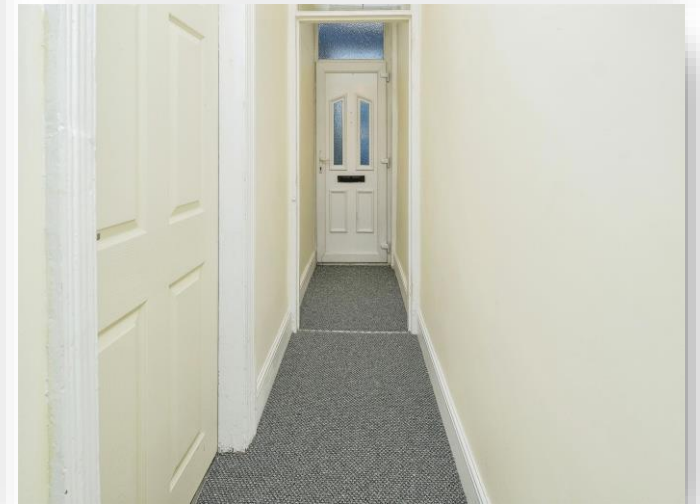
Romer Road, Liverpool L6 6DJ