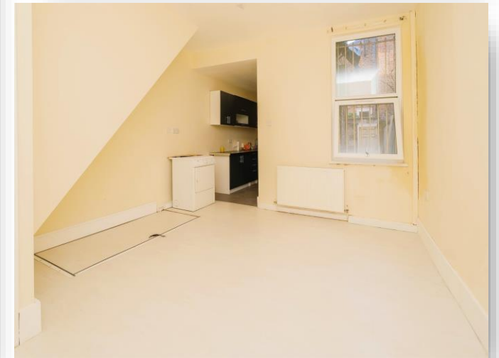
North Hill Street, Liverpool L8 8AG