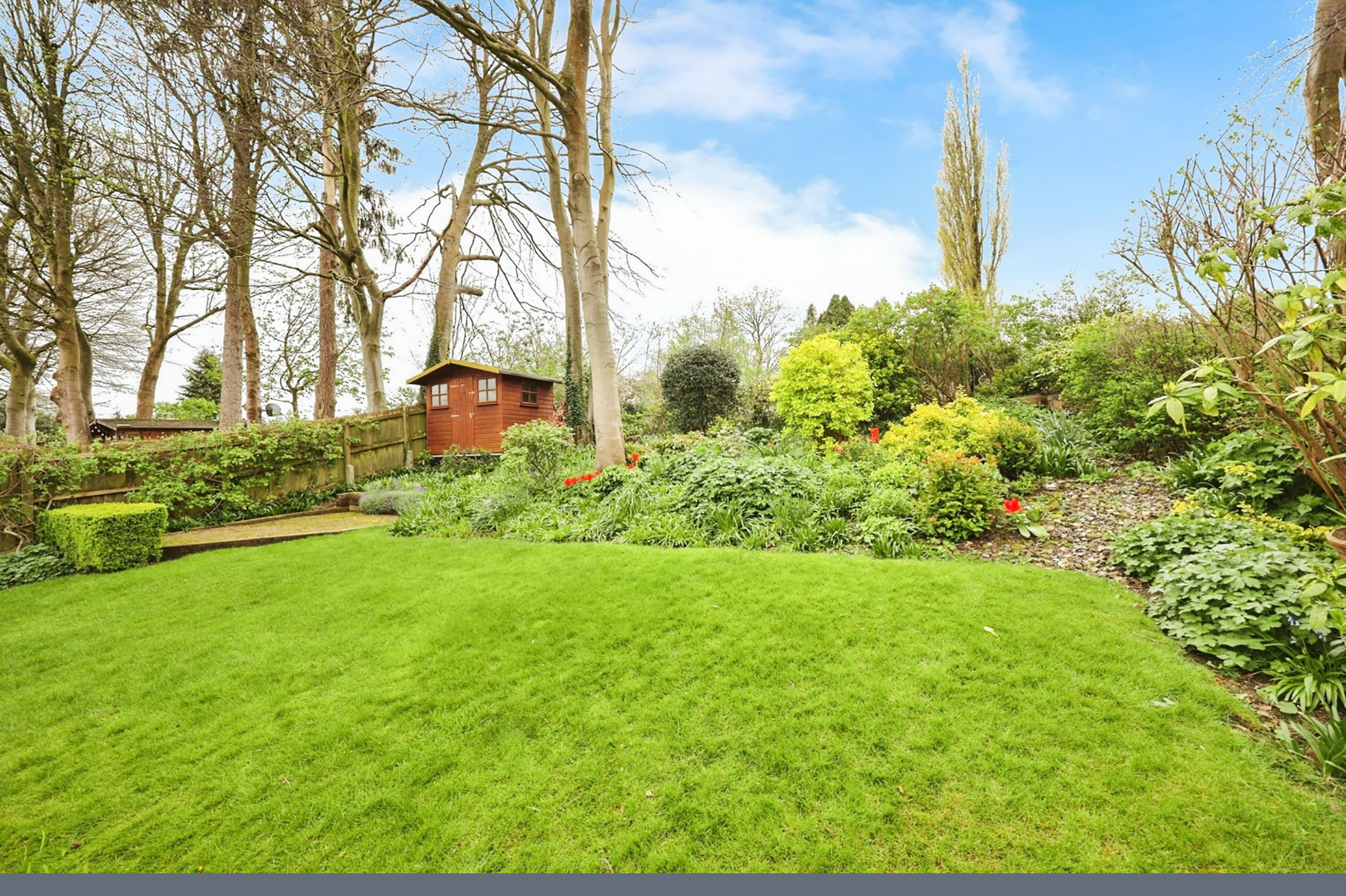
Residential Sales & Lettings | Mortgage Services | Conveyancing | Surveyors | Land & New Homes