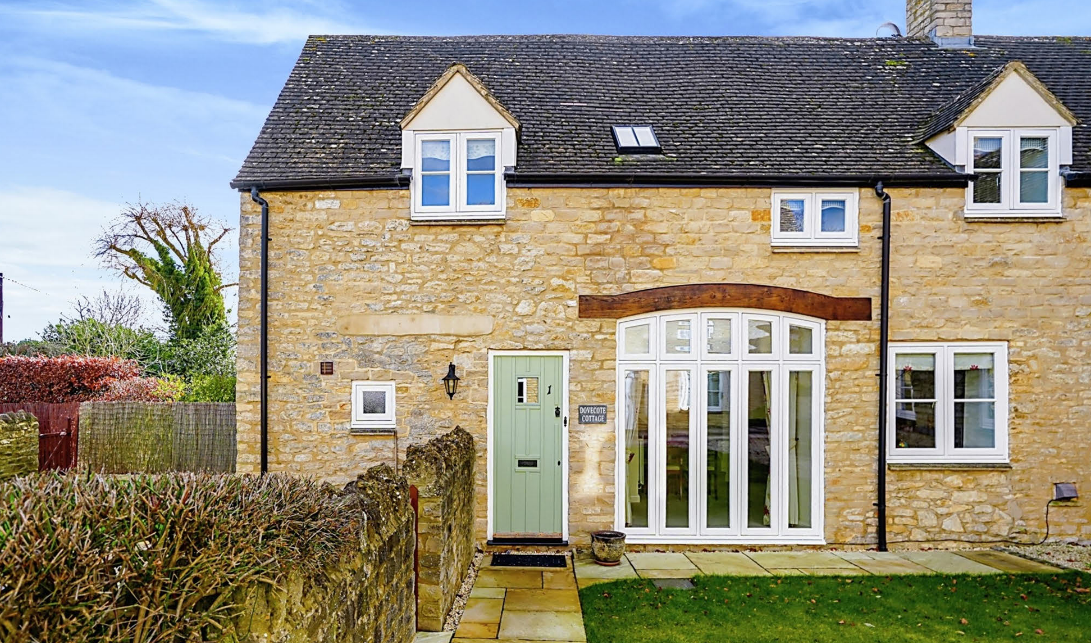
Dove Cote Cottage, Oxford Court Weston-on-the-Green, Bicester