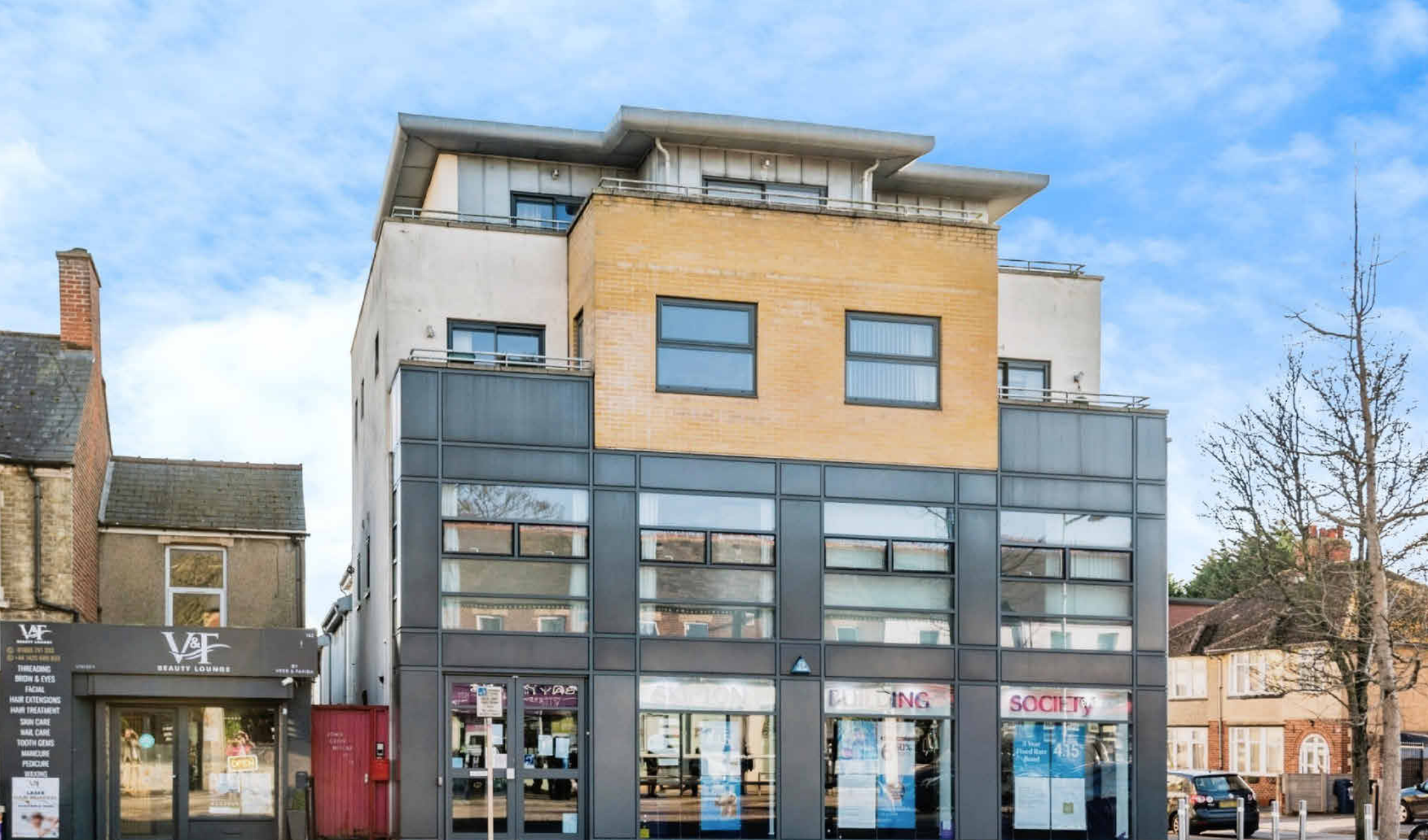
John Leon House, London Road