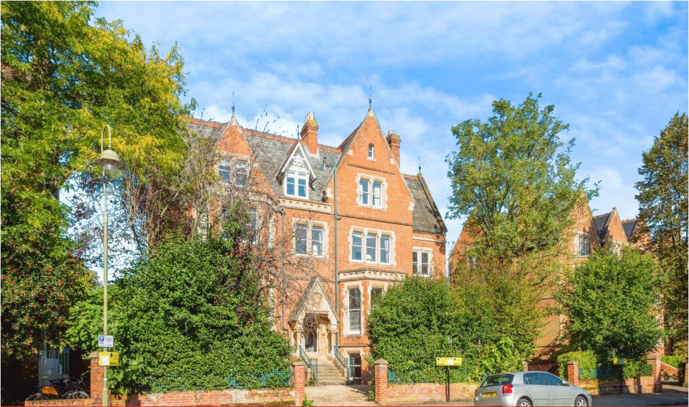
Norham Gardens, North Oxford