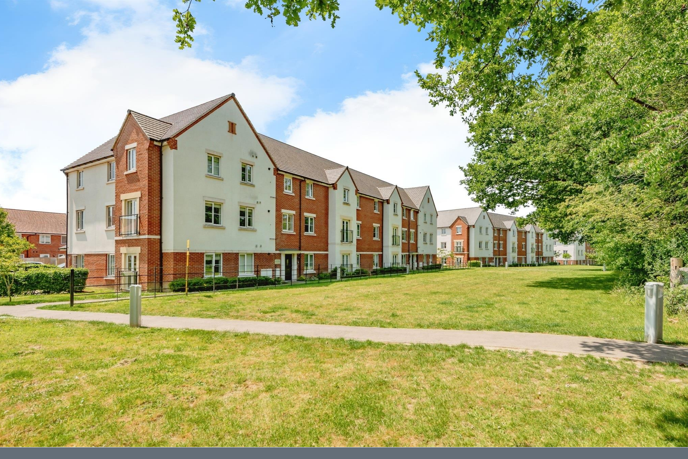
Residential Sales & Lettings | Mortgage Services | Conveyancing | Surveyors | Land & New Homes