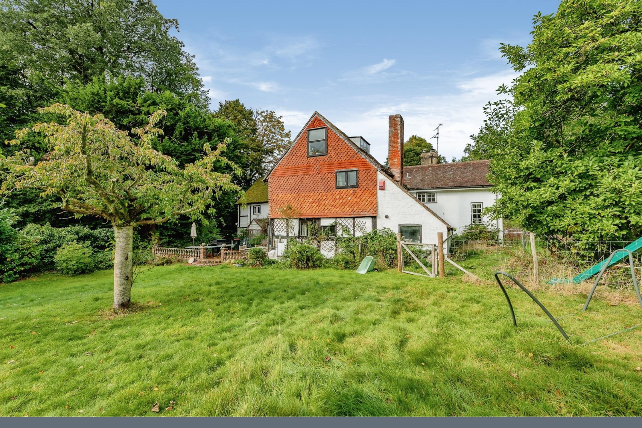
Residential Sales & Lettings | Mortgage Services | Conveyancing | Surveyors | Land & New Homes