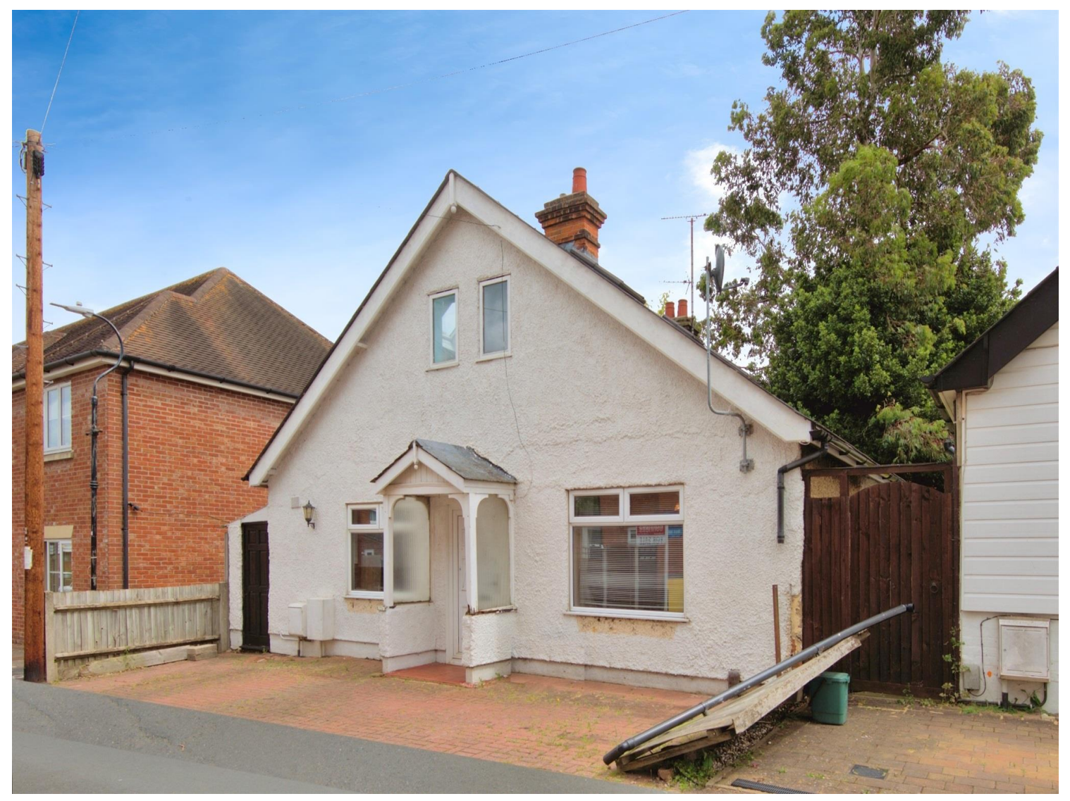
Meida Flores Lucas Road Colchester CO2 7EP

Offered to to the market with NO ONWARD CHAIN, this versatile home boasts excellent space and is well located for amenities.