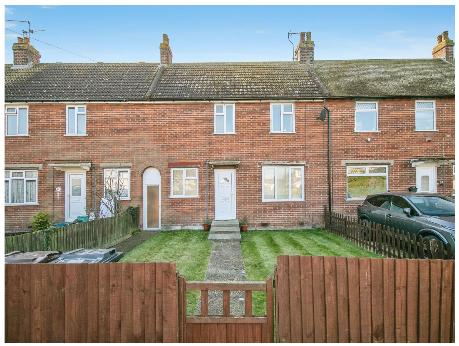
Speedwell Road Colchester CO2 8DT

Offering a wide range of versatile accommodation this two-bedroom mid terrace property provides ample living space perfect for a growing family, The current owners have meticulously improved and expanded current accommodation and it would provide a turn-key opportunity for a wide array of buyers.