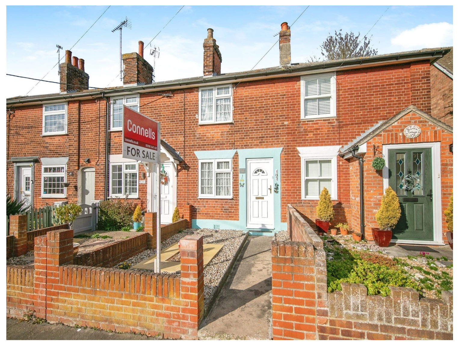
High Street Brightlingsea Colchester CO7 0EG

This charming cottage presented excellent condition, offering two bedrooms and wonderful social space.