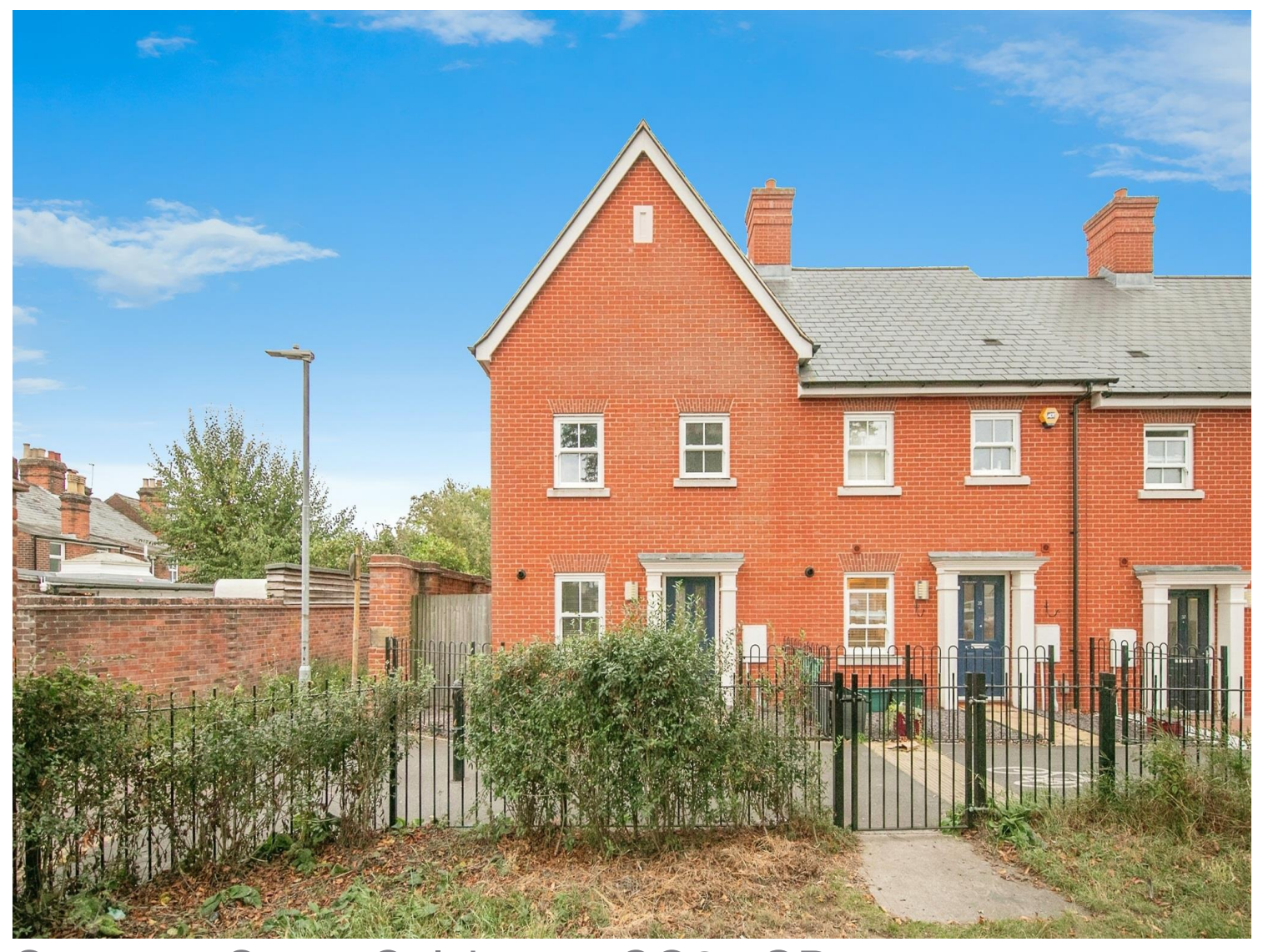
Sergeant Street Colchester CO2 7GR

Situated within a popular residential development is this well presented three bedroom end of terrace town house with the added benefit of being sold with no onward chain.