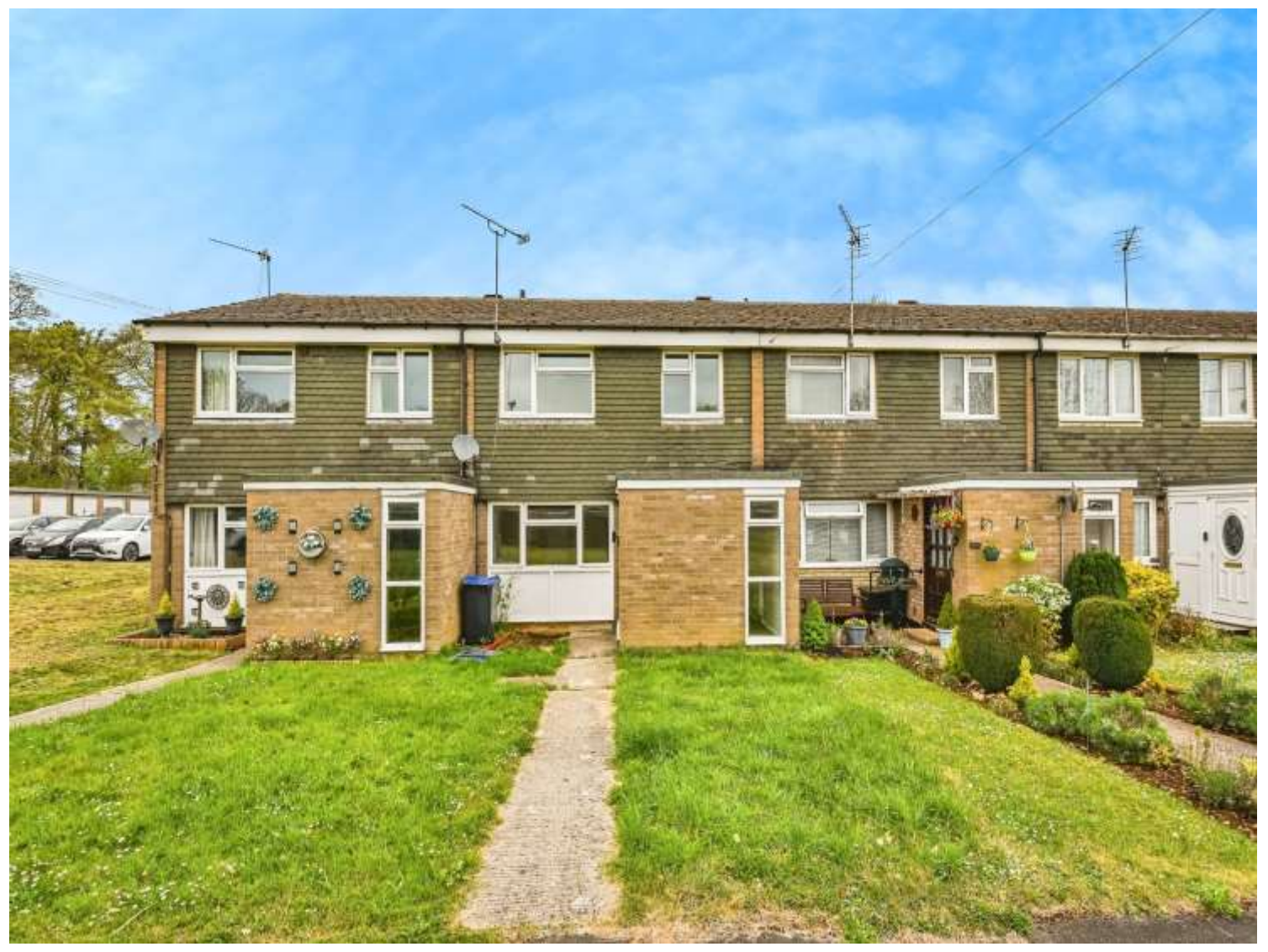
The Firs Chippenham SN14 0PG

Close to amenities. Close to local schools. Three Bedrooms. Freehold. Garden. Great for downsizing and Families. Viewing Advised. Sought after location.