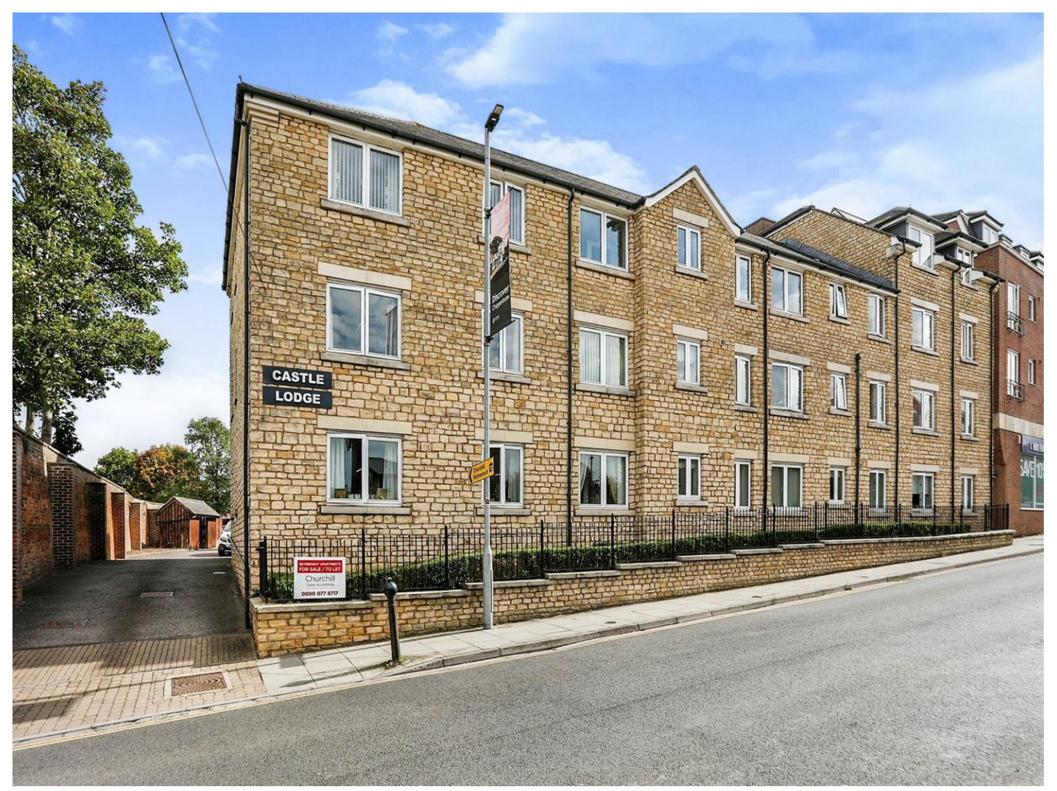
Castle Lodge Gladstone Road Chippenham SN15 3YY

Connells, Chippenham are pleased to present for sale this one bedroom top floor retirement apartment conveniently situated in the centre of town with easy access to local shops, bars and restaurants and the bus station.