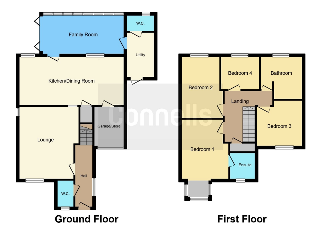
This floor plan is for illustrative purposes only. It is not drawn to scale. Any measurements, floor areas (including any total floor area), openings and orientation are approximate. No details are guaranteed, they cannot be relied upon for any purpose and they do not form part of any agreement. No liability is taken for any error, omission or misstatement. A party must rely upon its own inspection(s). Powered by www.focalagent.com

To view this property please contact Connells on