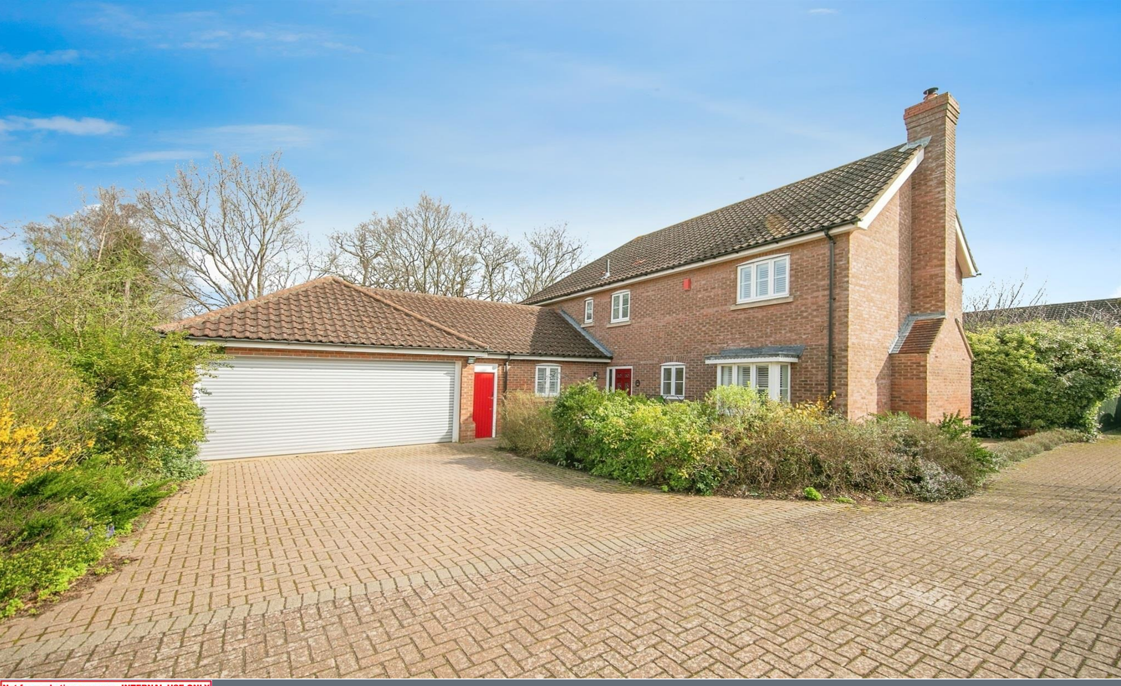
lot for marketing purposes INTERNAL USE ONLY