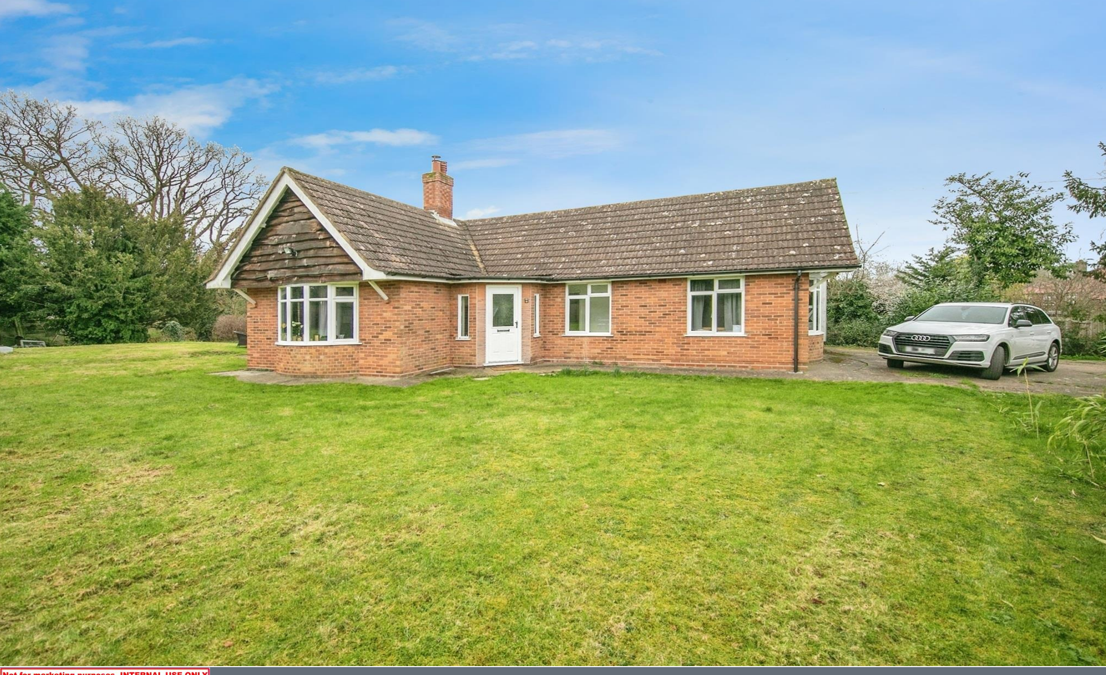
ot for marketing purposes INTERNAL USE ONLY