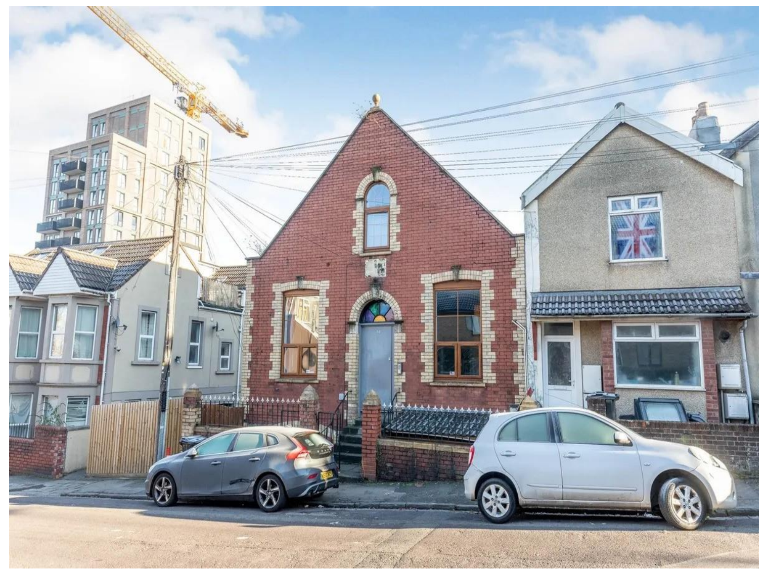
Church Of The Nazerene Summer Hill Bristol BS4 3BG

Connells are pleased to offer this lovely one bedroom flat situated within easy walking distance to Temple Meads, city centre and many local amenities. There is a well-sized living/kitchen area with a large double bedroom and modern bathroom. This property is being sold chain-free. Call 01179664278.