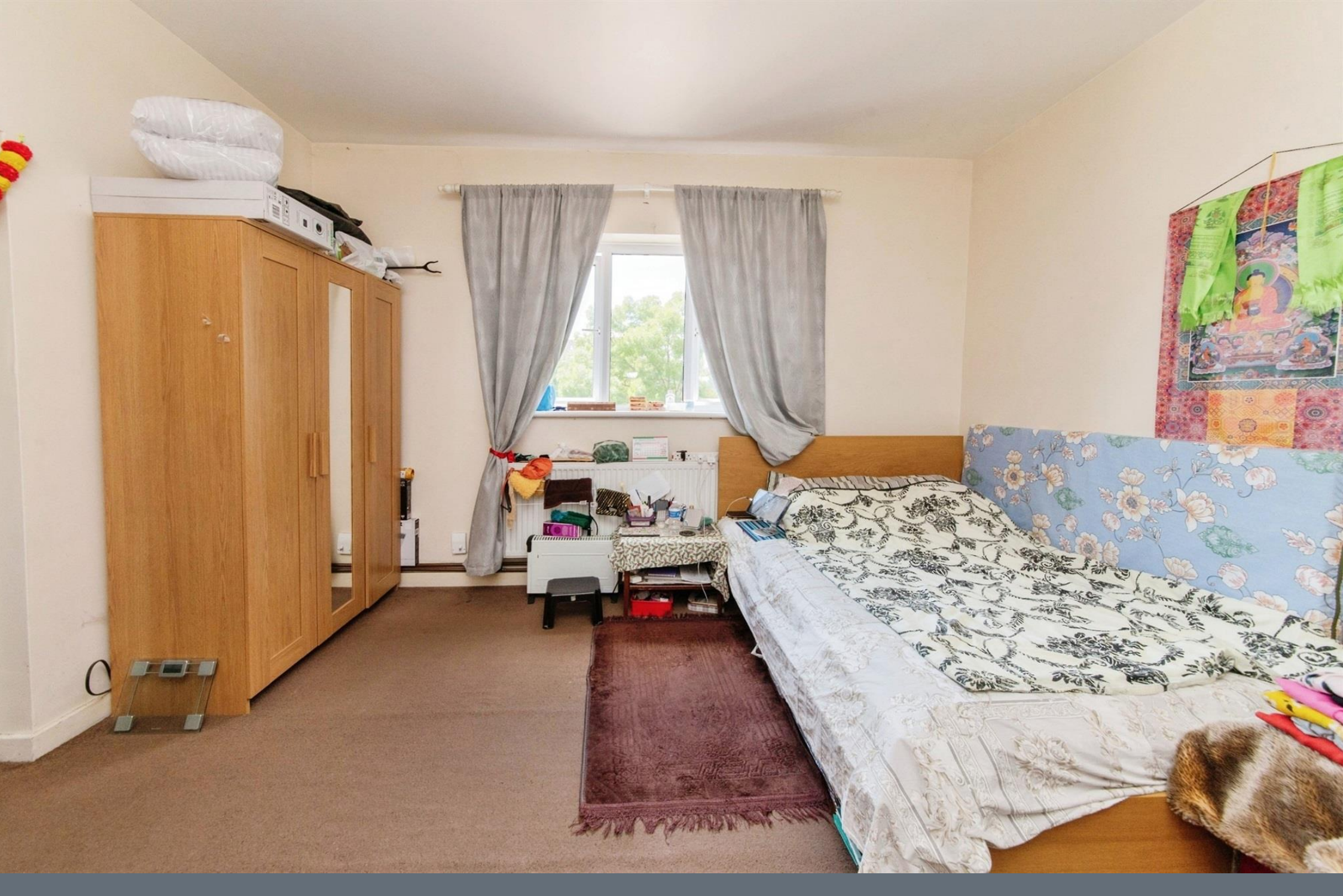
Residential Sales & Lettings | Mortgage Services | Conveyancing | Surveyors | Land & New Homes