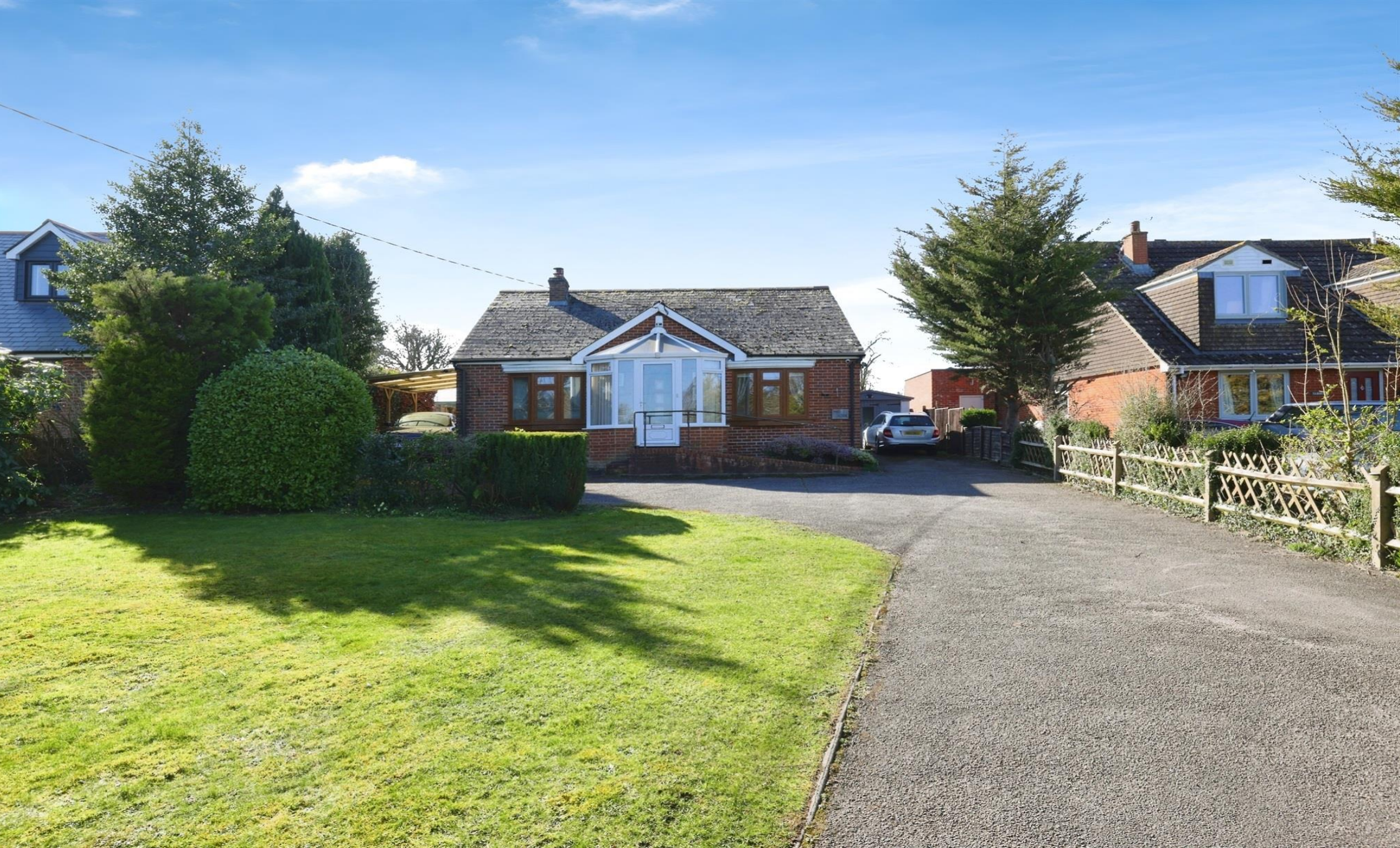
The Nook Wallop Road Grateley Andover