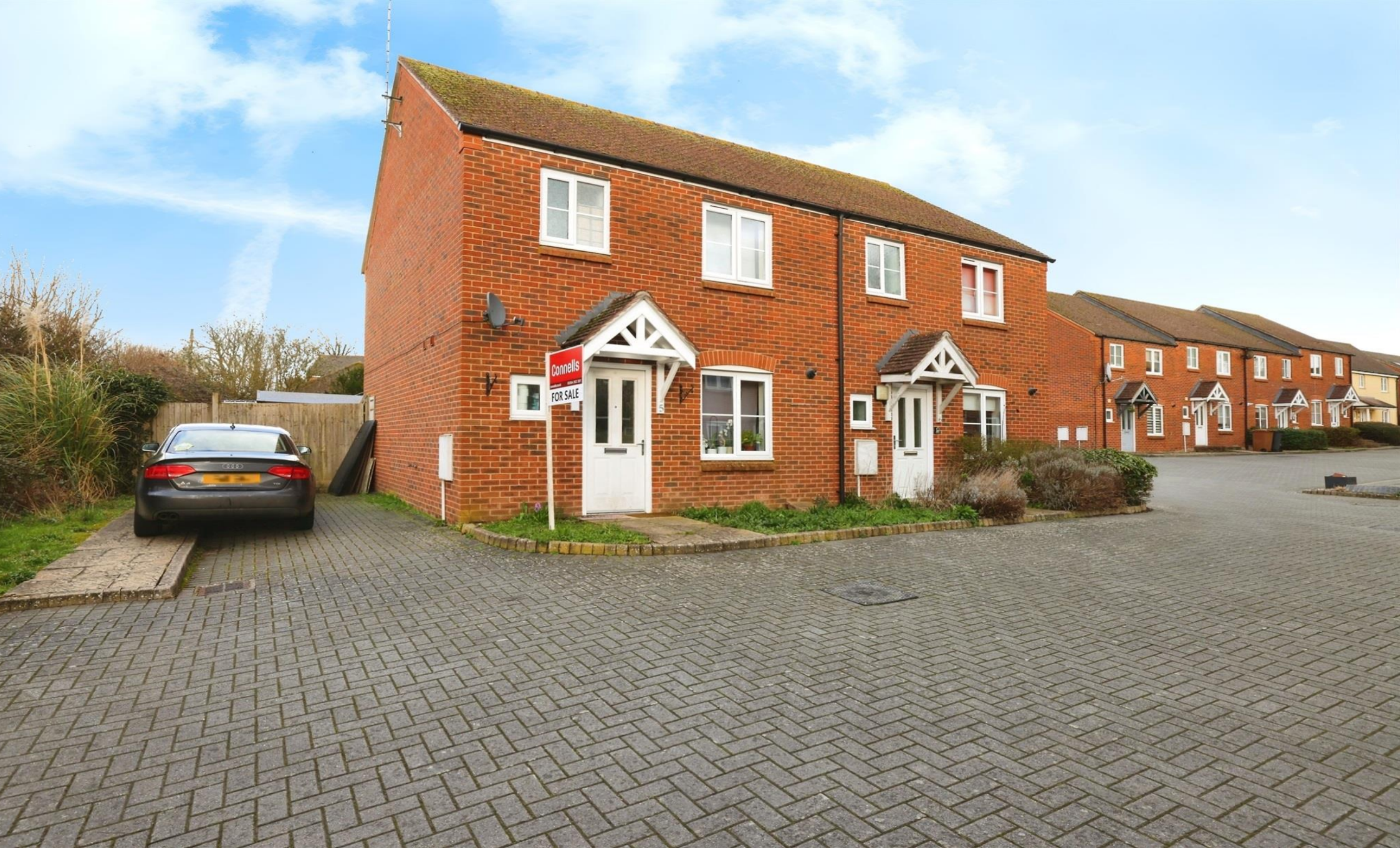
Bramble Walk Barley Road Andover